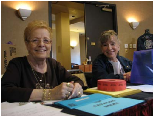
Beautiful smiles ☺ '13 BCD specialty