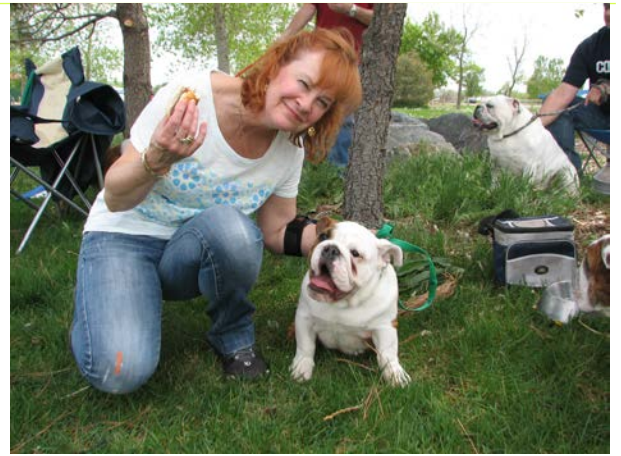
2015 Bullywalk...food, friends, feisty bulldog fixated on foodbites ☺