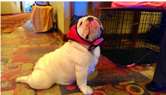
2014 BCD specialty ...a resting pose!