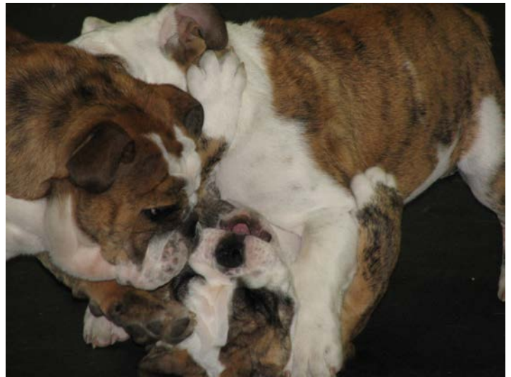
Puppy antics at the 2012 BCD B-match