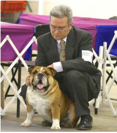
2015's Bulloween - a pride of "lions!"