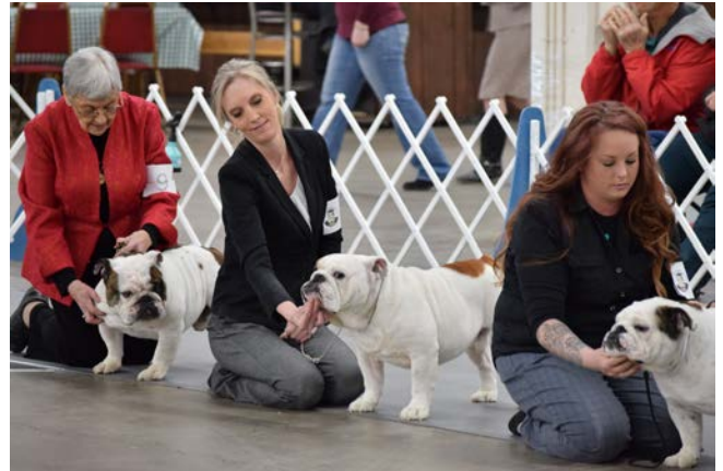
'18 BCD Spring Specialty – TRUE LOVE