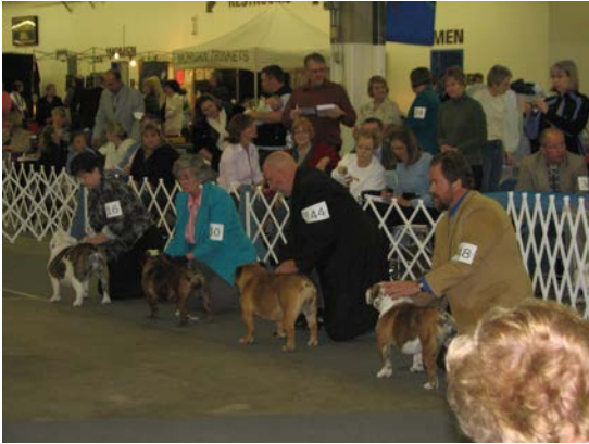
2011 CKC cluster, when the show was HUGE!