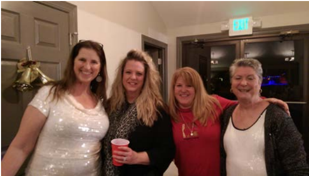
2016 BCD Christmas angels