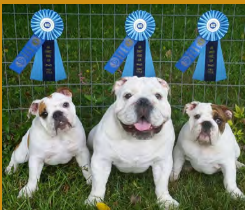
Photo Courtesy of Bulldog Club of America https://bulldogclubofamerica.org/vents/civic-achievement/